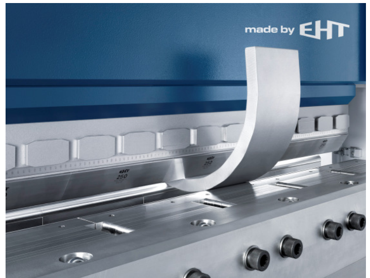
Bends small and thick components particularly efficiently.